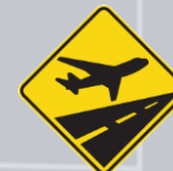
Yield to aircraft