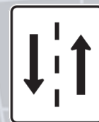
Drivers must use vehicle corridor