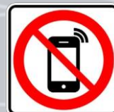
Handheld phone prohibited