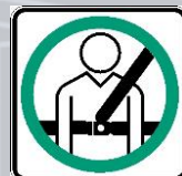
Seat belt mandatory