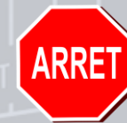
Stops (and lines)