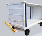
Maximum 6 carts 3 in bag rooms